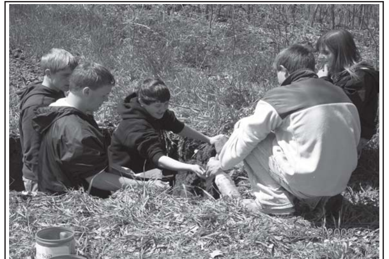
2009 West Holt High School Team members working in the Soil Pit at the Nebraska State Envirothon Competition.

West Holt High School began qualifying for the state Envirothon in 1997 by winning the Northeast Regional Competition. Since then West Holt has qualified 10 out of the last 13 years with their best finish occurring in 2004 when they placed runner-up to Norris High School, the only other school in Nebraska to attend more Envirothon competitions than West Holt.